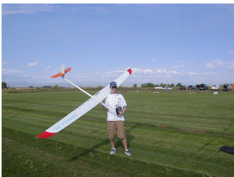
Colorado Challenge Cup RMSA 1st Place September 16, 2007