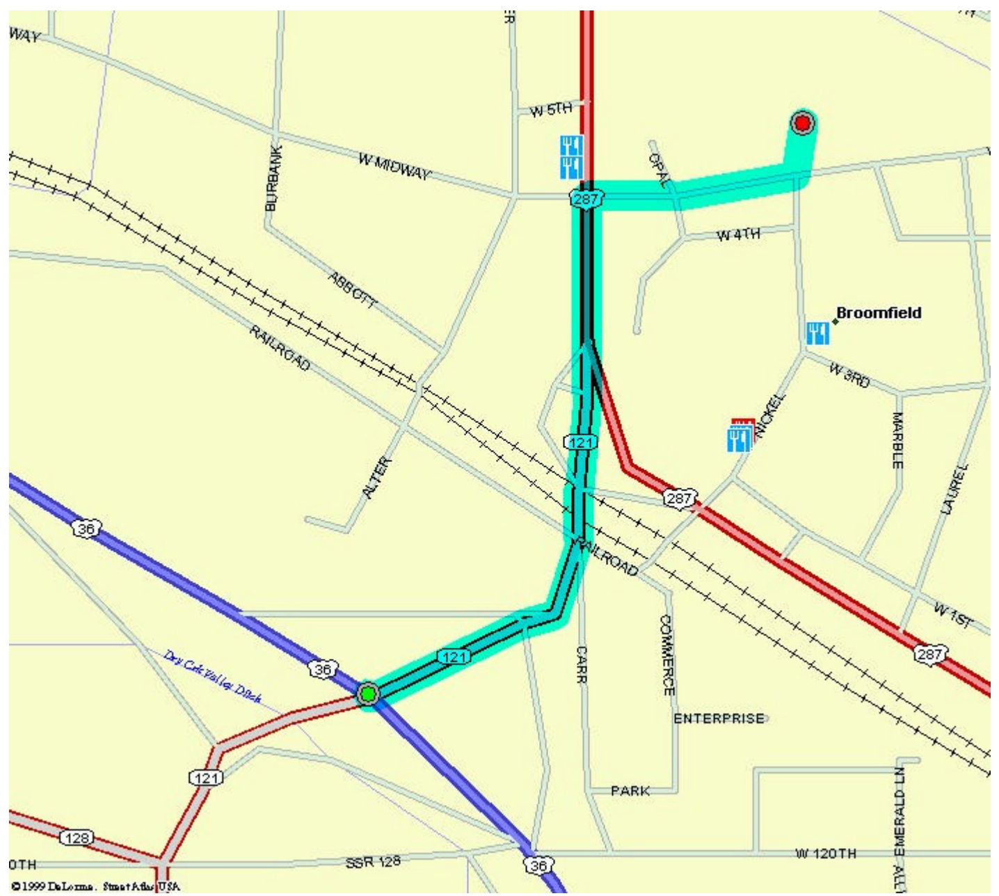
Map to new meeting location