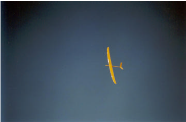
Skip's Escape – beautiful with 6 servos IN THE WING

Don Ingram's Xantipa going up the histart