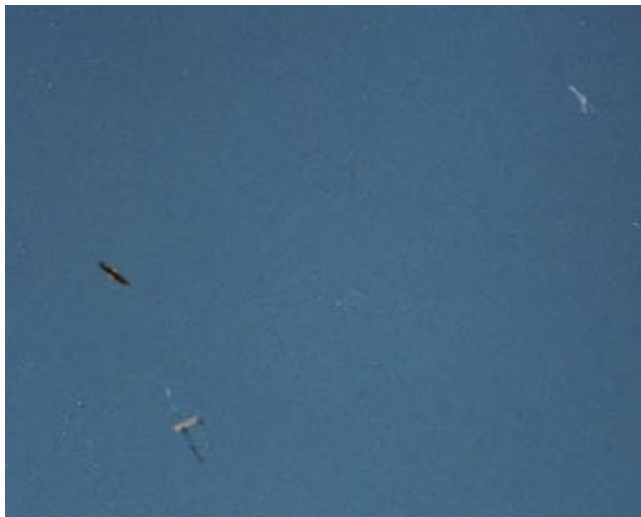
Here is a picture of Skip and I with the Bald Eagle I hope it comes out OK