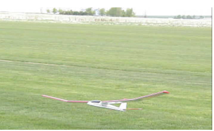
Zach's Plane on Approach