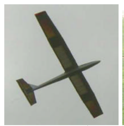
Zach Underwoods 1st Flights